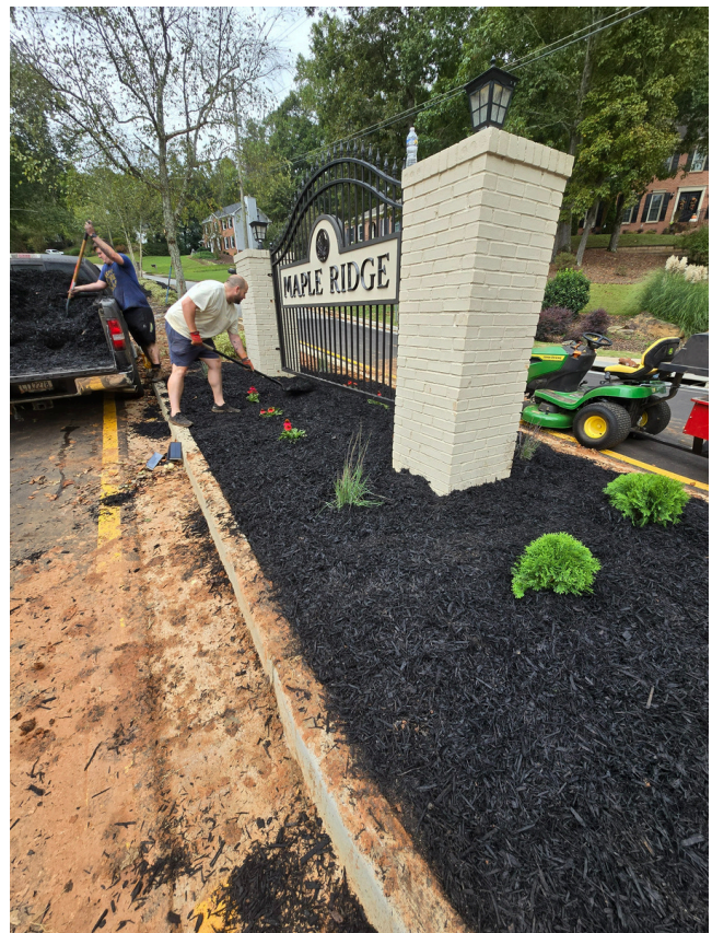
Landscaping at the Suwanee Creek Entrance. Volunteers worked to design and add new landscaping to the space after the road construction was finished.

Do you want more events in the neighborhood, maybe you have a love of holidays and party planning, or have a fun idea you want to try? Join the Social Events Committee!